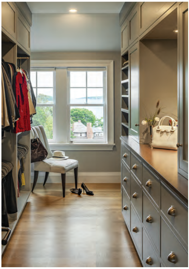
The house is a modern transitional Shingle style. The detail and craftsmanship are impeccable.

Suddenly the work order went from a small expansion to a whole new second floor and a major renovation. The home’s new identity took off that day like a rocket, with architect, builder, crews, and the homeowners in shared camaraderie and mutual respect.