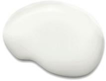
High Reflective White