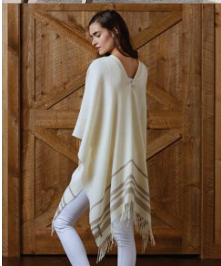
(Left) Alicia Adams Alpaca specializes in the design and production of textiles and clothing utilizing the natural and sustainable characteristics of alpaca wool.

“ We are on trend and ready for Spring with every possible value of Green paired with the reflective properties of fun metallics and graphic silhouettes. Spring 2017 will be a stunning!